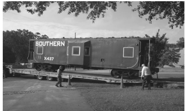
Loading caboose onto flatbed truck.