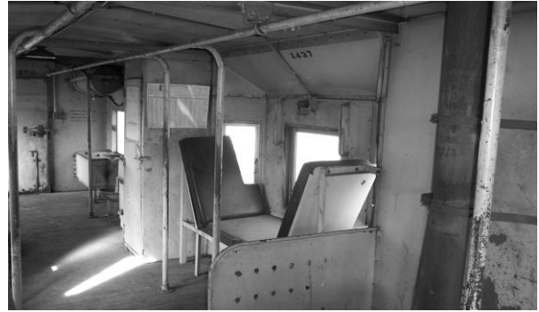
Interior of caboose.